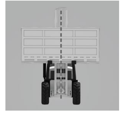
Operators must ensure that the crates are fully supported and balanced before lifting.