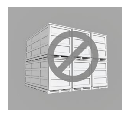
Crates should not be stacked on top of each other.