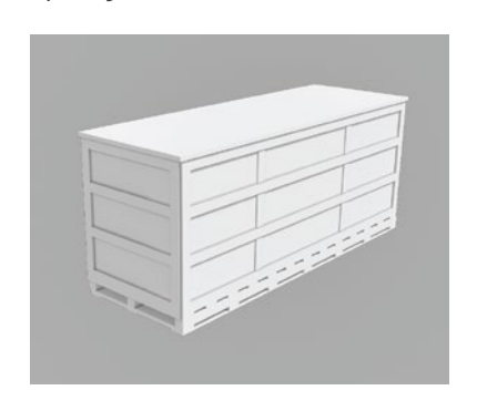
Prop the front of the crate up at least 10 cm to ensure the panels are leaning toward the back before opening the front of the crate.