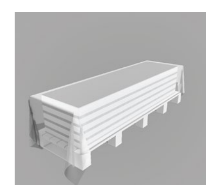
Crates must be stored under cover for protection against external factors.