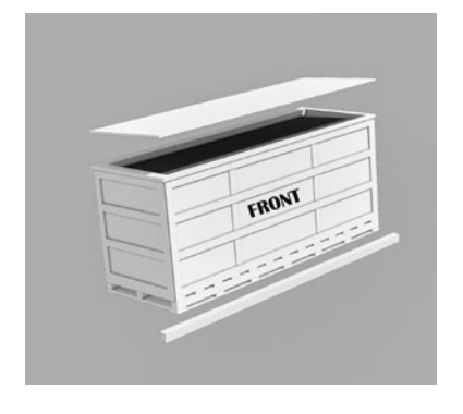
Remove the lid of the crate. If needed, remove the front of the crate.