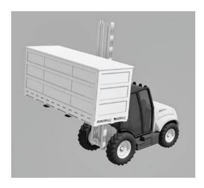
Crates must be lifted with a forklift or a crane.